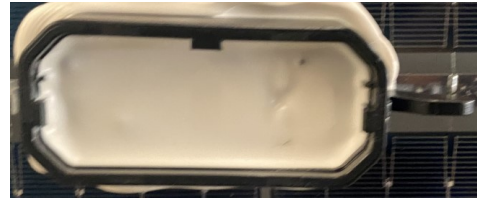
Junction box (opened)