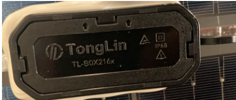
Junction box (TL-BOX216x)